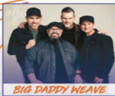
BIG DADDY WEAVE