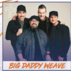
BIG DADDY WEAVE