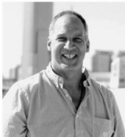
Parishioner of St. Helen

US WINDOW DOOR & MORE Serving Northeast Ohio for over 60 years