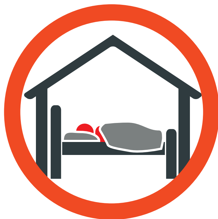
Stay Home When Sick