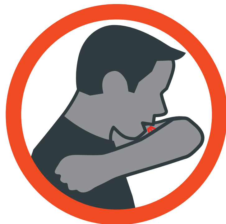
Cough or Sneeze into Your Elbow