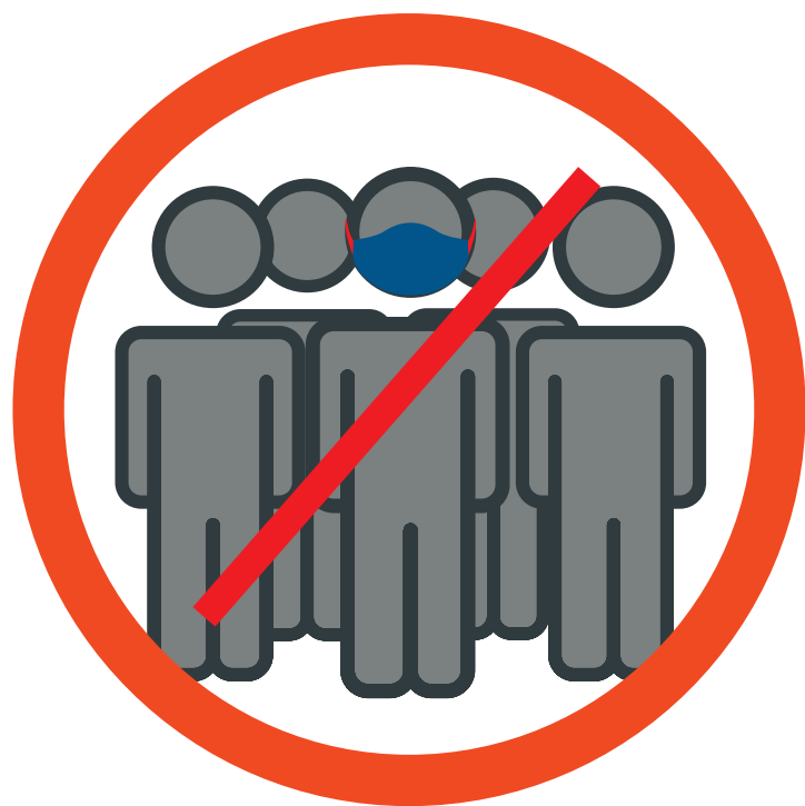
Avoid Large Groups