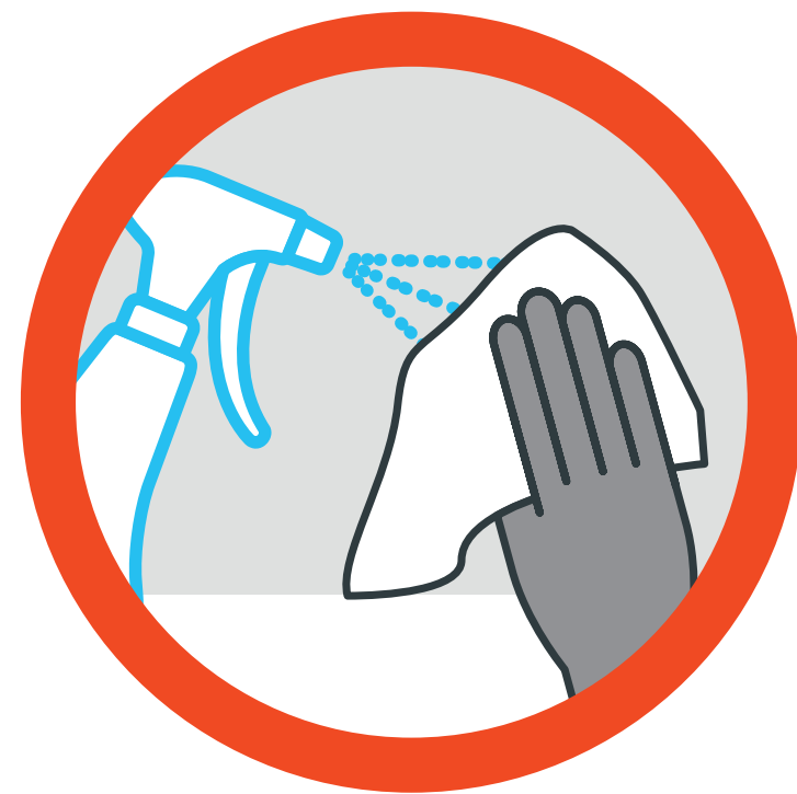
Clean and Disinfect